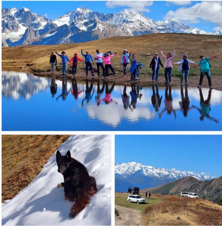
Lake Koruldi Mestia

Day 9 Mestia-Kutaisi Drive 136kms to Zugdidi to visit Dadiani Palace. Once considered one of the most eminent palaces in the Caucasus, today it house a History and Architecture Musuem.We should arrive at our agro hotel nicely located in the lush Kutaisi countryside, by early afternoon. Wine and dine will be the order of the rest of day with cultural folk performance, Georgia is after all, the 'cradle of wine' with wine-making evidence found here dating 8000 years back! Overnight Kutaisi(B,D)