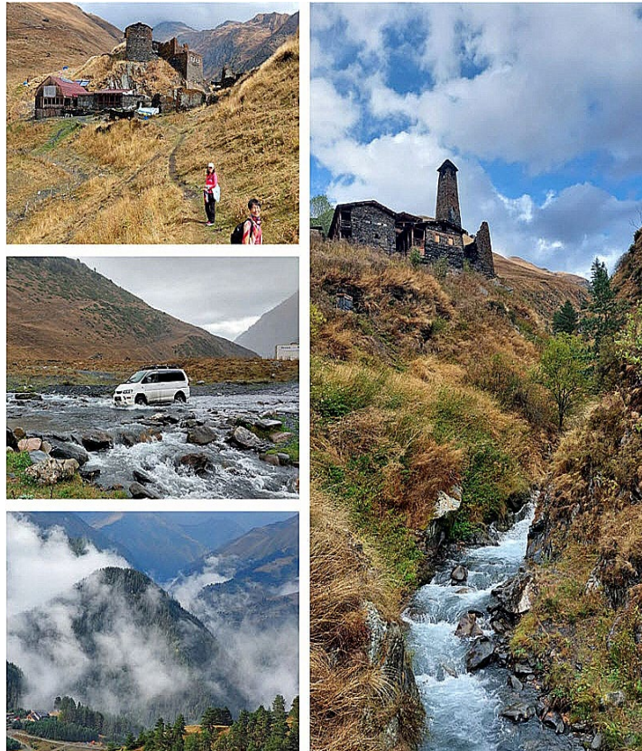
Tusheti National Park - opens only 5 months in a year.

IMPORTANT NOTICE: This is meant to be a "free and easy" adventure trip. Participants should be relatively fit, with a good sense of humor, and above all, have the right attitude for close travel with others through possibly some trying times. Most definitely, this is not a trip for prudes, whiners, fuss-pots, and other similarly assorted types! We had a couple of those before and it wasn't pleasant for us or them. Although every effort will be made to stick to the given itinerary, ground conditions may change and cause some disruption and/or deviation from the norm. Otherwise, have fun.