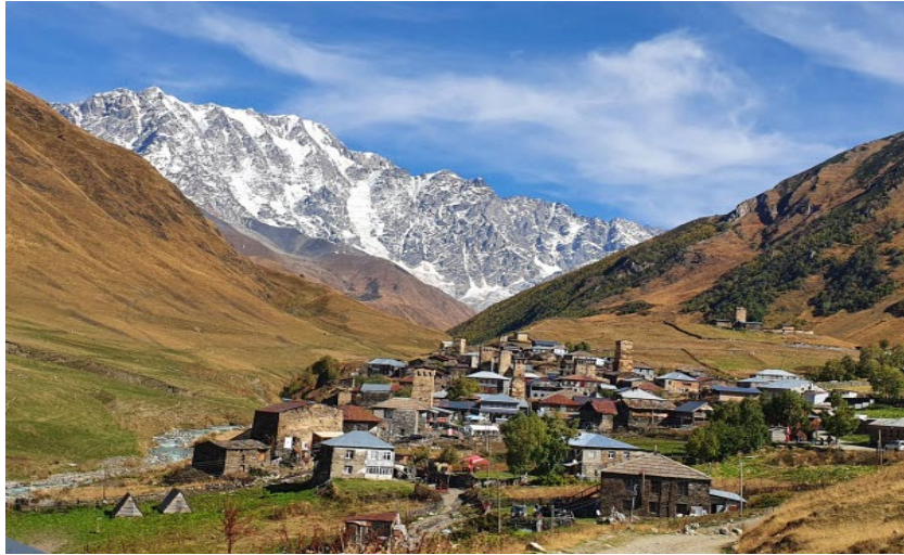
UNESCO list Ushguli Village in Mestia

Day 4 Okatse Canyon-Tskaltubo A short drive will bring us to Okatse Canyon and we will take in a nice and easy 2-3hrs 6km morning walk along a stone path and boardwalk in the Dadiani Forest. Panoramic views from the 20m extended platform will be a highlight. Visit a Soviet-era relic, Tskaltubo Spa Resorts. Once a gem of Soviet Wellness Tourism for the Soviet elites, today most of the palatial buildings are now like 'lost in time' majestic monuments. Overnight Kutaisi (B)